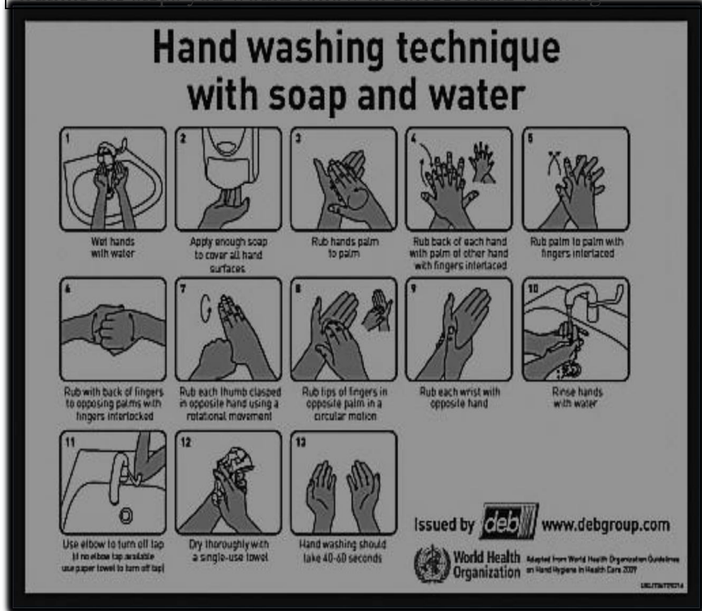
Fig. 3: Hand washing technique

Outline the steps you would follow in correct hand washing